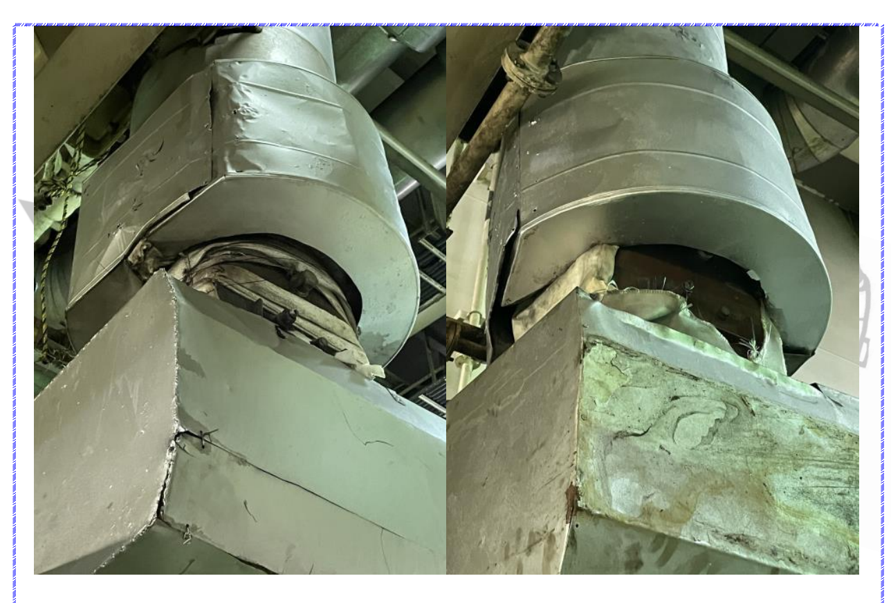
Picture of other deficiency: Fresh water generator outlet pipe temporarily repaired with doubler